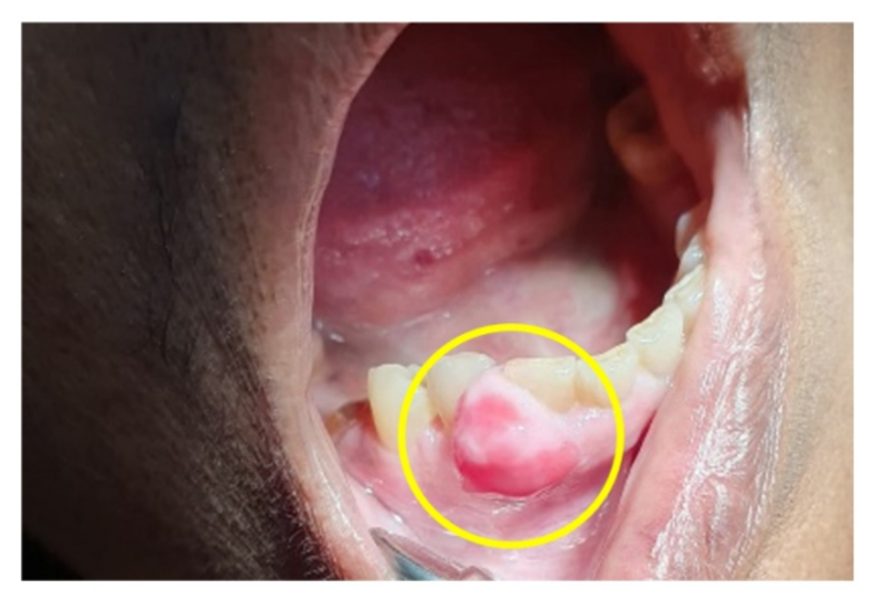
Fig 1: Ovoid firm gingival swelling extendidng from 41 – 43 region